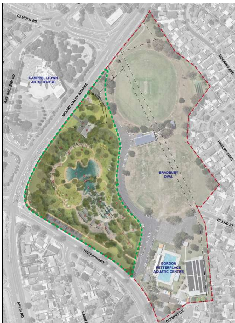
Figure 5: Billabong Masterplan

The Billabong Parklands are identified with green on the map. The Billabong precinct is outlined by a red line.