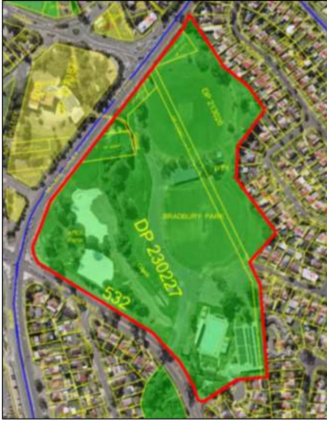
Figure 1: Subject site

The subject site incorporates 8 lots as identified above and are all owned and managed by Council. The site is currently zoned RE1 – Public Recreation and is identified as Community Land. The purpose of the planning proposal is to reclassify the land from community to operational land.